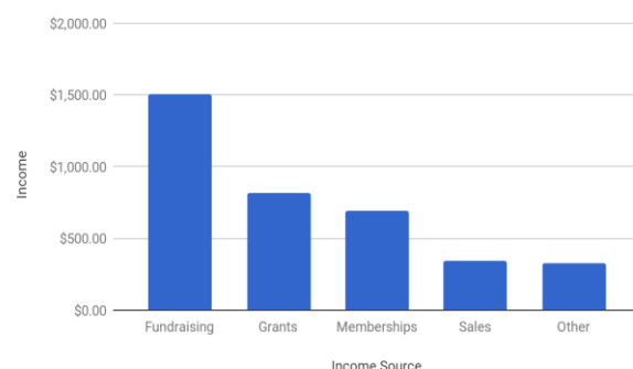
2017 Income Sources

The club applied for 2 grants through UniSA Sport and was privileged to receive $700 for new club owned uniforms and $120 for the funding of O'Week flyers (Note 4: UniSA Sport Grants). Memberships jumped significantly in 2017, with 45 memberships purchased for the year. The club had two membership options, a standalone membership for $15 and a membership and disc for $25. In the income statement the discs are deducted from the membership income ($810 memberships - $180 discs = $630) (Note 1: 2017 Memberships).