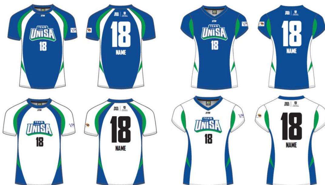
An example of the UniSA Volleyball Club Uniform