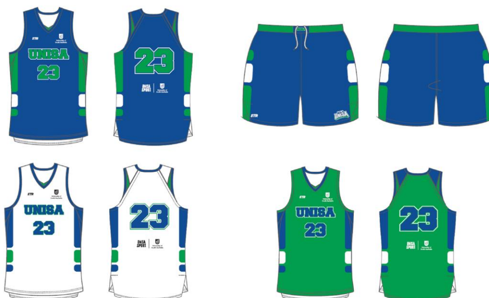
An example of the UniSA Basketball Club Uniform